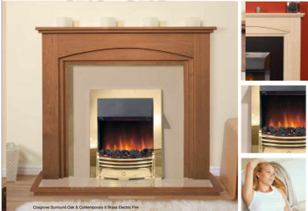
Cosgrove Surround Oak & Contemporary II Brass Electric Fire