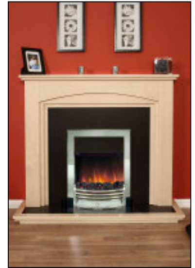
Cosgrove Suite Maple & Contemporary II Chrome Electric Fire