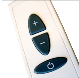
Remote control supplied.