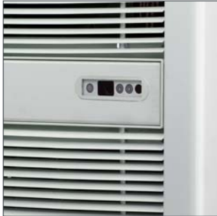
SLIM-LINE RC control panel.