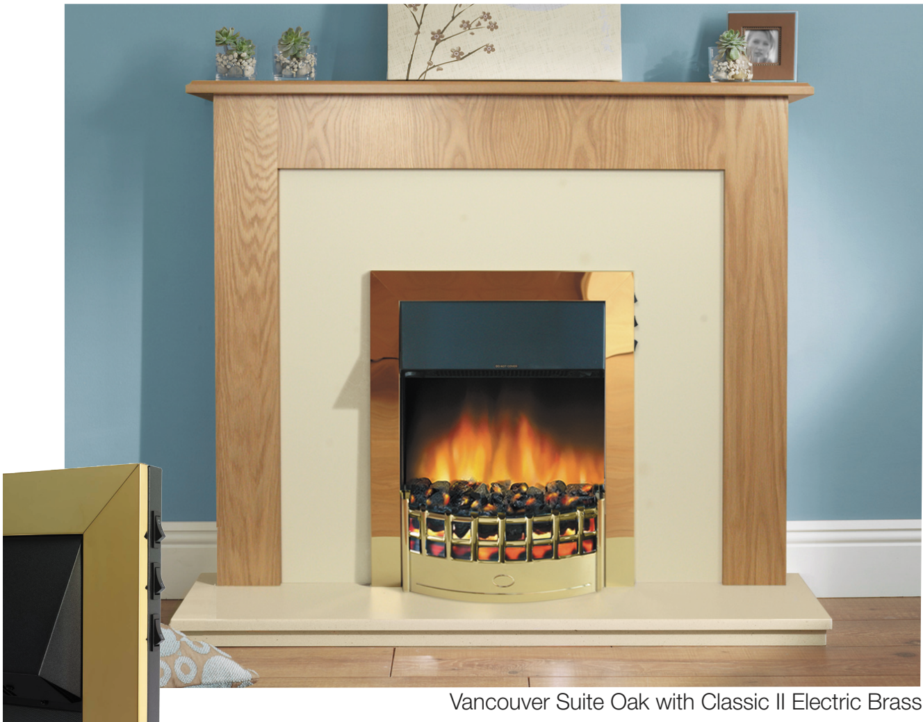
Vancouver Suite Oak with Classic II Electric Brass