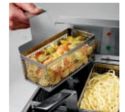
Optional half-size basket inserts (BA158) for cooking individual portions