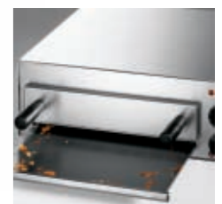
Large crumb tray for easy cleaning