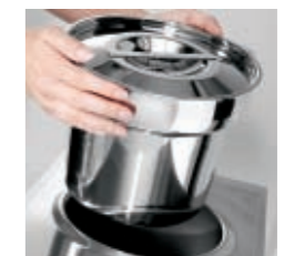
Supplied with stainless steel round pots