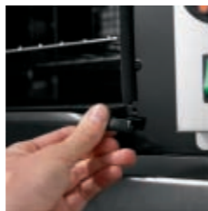
User-replaceable door seals