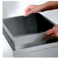
Removable tank allows wet heat models to be operated with dry heat