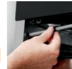
User-changeable quartz infra-red elements