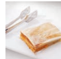
Optional toasting bags (TO10)