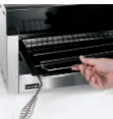
Model LGT supplied with grill pan and toasting rack