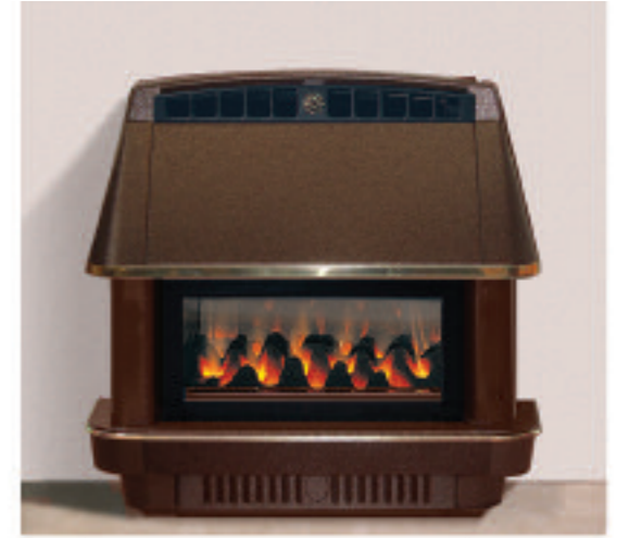
Firecharm RS Electric - Bronze Finish

Living Flame Balanced Flue Electronic Ignition