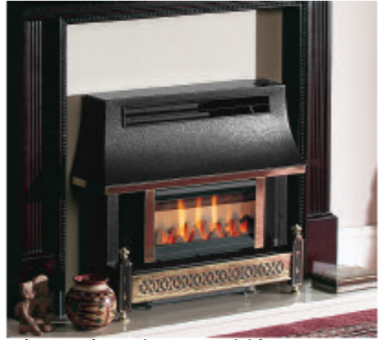
Sahara LF Electric - Pewter Finish

Living Flame Balanced Flue Electronic Ignition