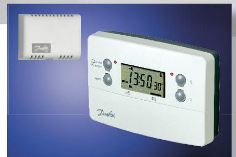
TP9000 with TS2 Sensor