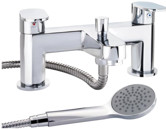
X70 Bath Shower Mixer Deck Mounted