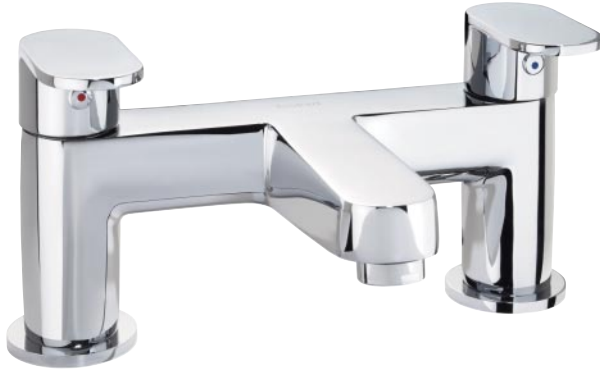
X70 Bath Filler Deck Mounted