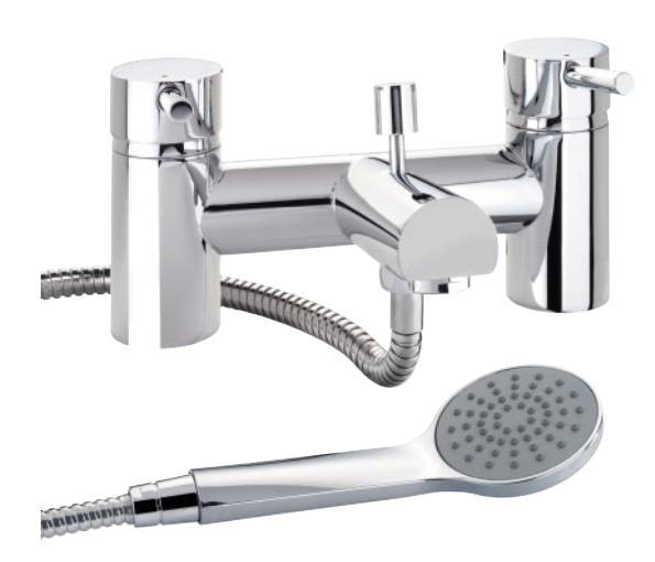
X60 Bath Shower Mixer Deck Mounted