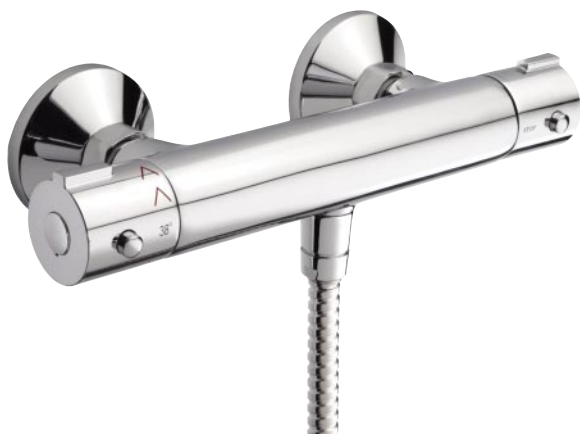
X120 Thermostatic Shower Bar Valve