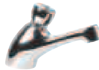
sola | non-concussive press action tap

Trust Twyford to exceed the government's guidelines.