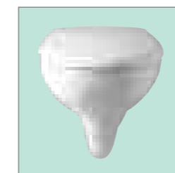
Galerie wall hung