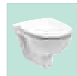
Refresh wall hung