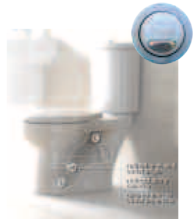
Galerie flushwise WC Pack - GECO42WH