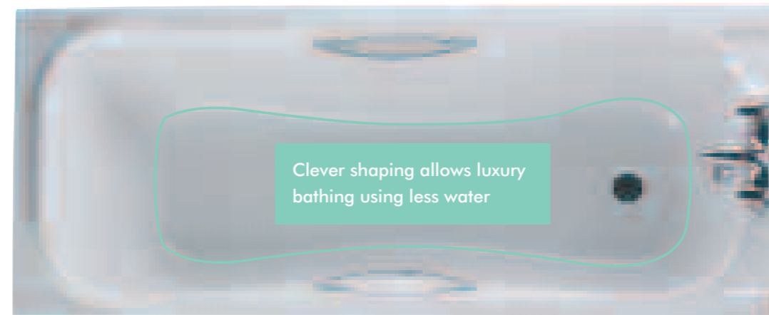
Twyford Signature bath

Trust Twyford to have such a low volume bath.