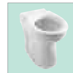
Avalon Rimless back-to-wall