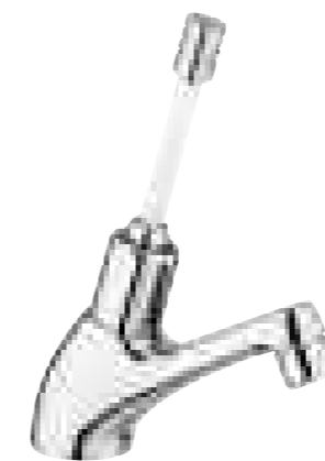
sola | non-concussive toggle tap