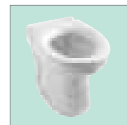
Sola Rimless back-to-wall