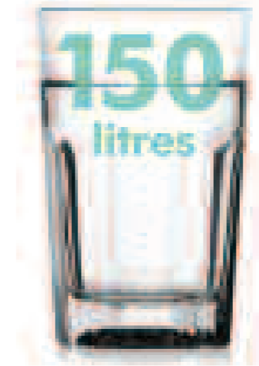
Water use in the UK home