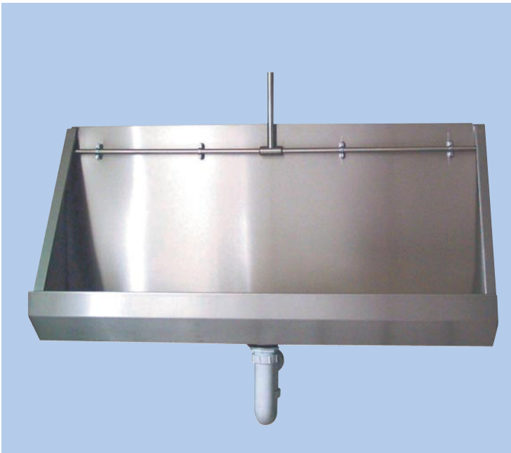
1200mm wall hung urinal (illustrated)