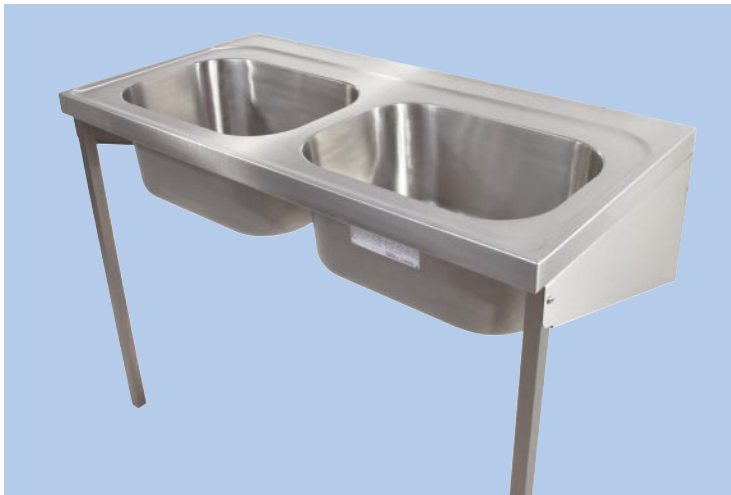
Hospital sink with double bowl, no tap holes, cantilever bracket & legs

radiused easy clean internal surfaces underside sound deadened