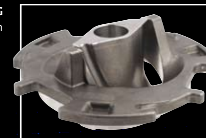
SEG Cutter System

The Grundfos patented grinder system ensures the reliable and efficient grinding of solids to even smaller pieces. In addition to extremely effective and reliable operation, service is easy, with quick dismantling for replacement of wear parts requiring no special tools.