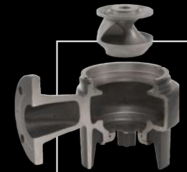
SL1: Single-channel impeller