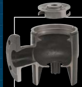
SLV: SuperVortex impeller

The SLV pumps range has a SuperVortex impeller and is ideal for liquids with a high concentration of solids, fibres, or gassy sludge, while the SL1 pumps range has a single-channel impeller and is ideal for large flows of raw sewage.