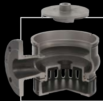
DP: Semi-open multi-vane impeller