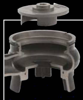
EF: Open single-vane impeller