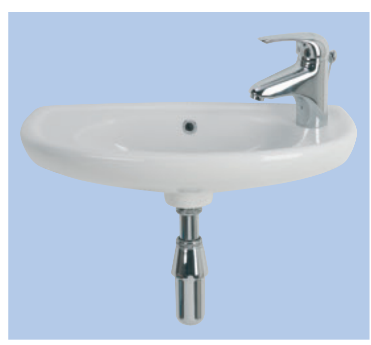
Galerie optimise 535 x 260mm short projection basin with basin monobloc