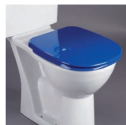
Blue toilet seat