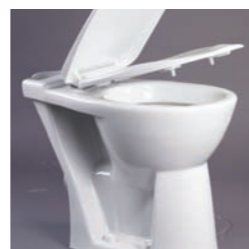
Raised height WC