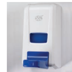
Liquid soap dispenser