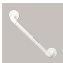
White natural fluted grip grab rail