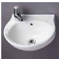
2 Tap hole finger rinse wash basin

Product Code: 23202 (White) / 23203 (Blue)