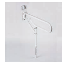
Fold up white grab rail