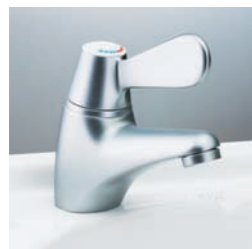
TMV3 Thermostatic sequential mixer tap