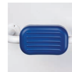
Padded back rest