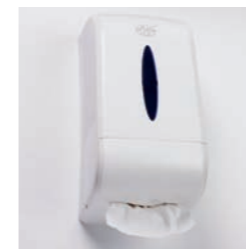
Toilet tissue dispenser