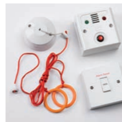
Alarm & pull cord