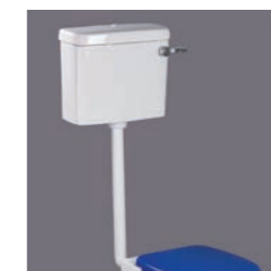
Low level cistern