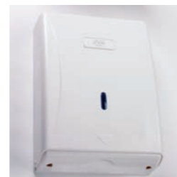
Large paper towel dispenser