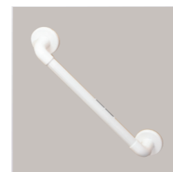
White fluted grab rail

Product Code: 23204 (White) / 23205 (Blue)