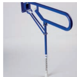
Fold up blue grab rail